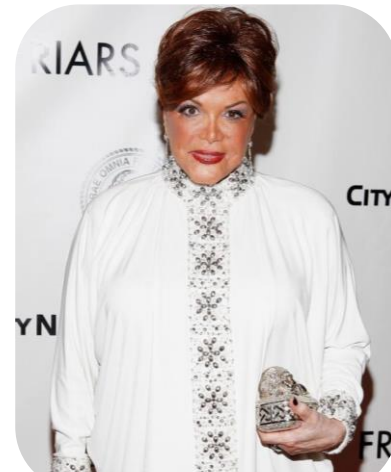
Francis – seen here in 2011.

Connie's life, while dazzling in the public eye, was not without its shadows. She endured personal tragedies, career setbacks, and years of silence due to trauma - but she returned, time and again, with grace and defiance. Her autobiography "Among My Souvenirs" candidly shared her battles and triumphs, helping others find courage through her honesty.