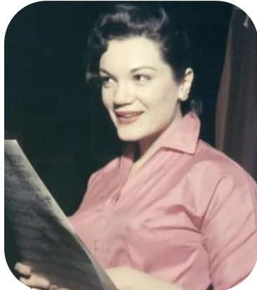
resurgence on social media.